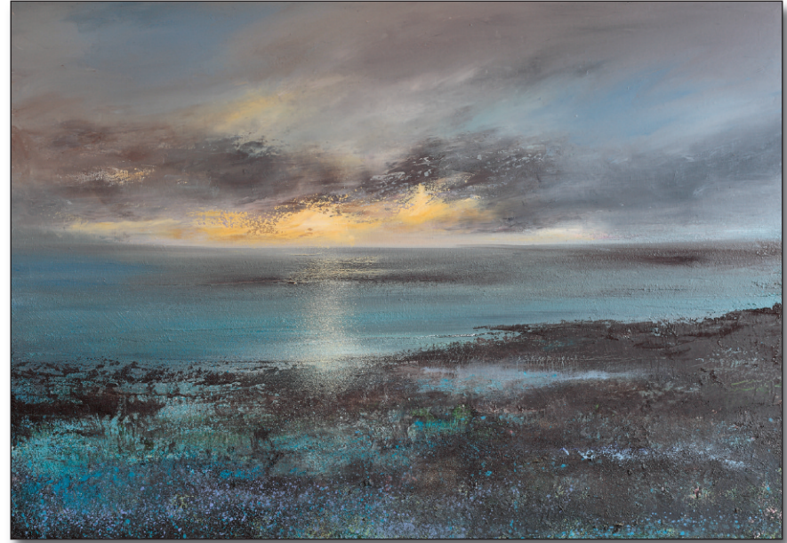
Amanda Hoskin. Setting Sun, Mount's Bay Mixed Media 27.5x40in (70x101cm)